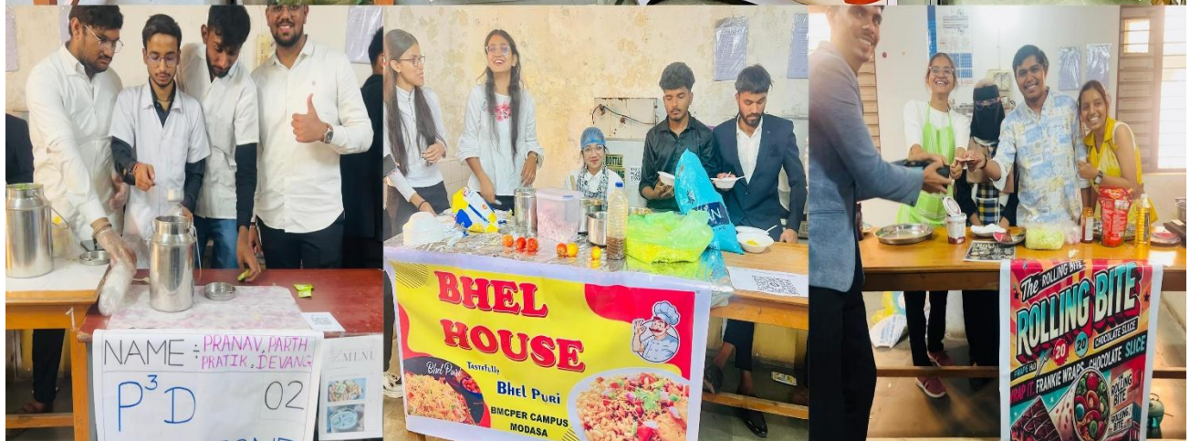
Various Food Stall Photos